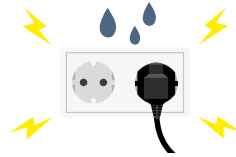
WATER NEAR ELECTRICS